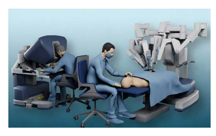
Fig. 2: A surgeon sits at the console controlling the arms of the robot with an anesthesiologist taking care of general anesthesia.

2. Robotic or robot-assisted surgery. In robotic surgery, surgical instruments, including a video camera, are placed into the small cuts, which are attached to the arms of a robotic interface controlled by the surgeon from a robotic console (Fig. 2). At the console, the surgeon can see a highly magnified and clear 3D view of the area to be operated upon.