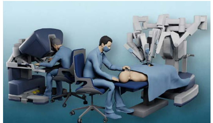
Fig. 2: A surgeon sits at the console controlling the arms of the robot with an anesthesiologist taking care of general anesthesia.