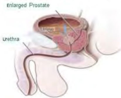
Fig.3 Cross section Enlarged prostate (Benign Prostatic Hyperplasia - BPH)

If treatments fail to improve a patient's complaints, surgery can solve the problem by removing the excess prostate tissue and leaving the outer prostate in place. This procedure is called a transurethral resection prostatectomy (TURP). This is not the same as a standard prostatectomy (surgical removal of the prostate gland) sometimes used in cases of prostate cancer.